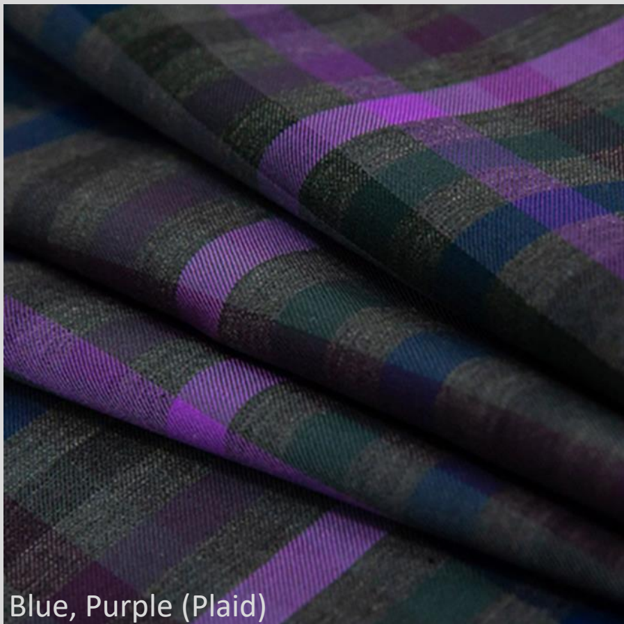
Blue, Purple (Plaid)