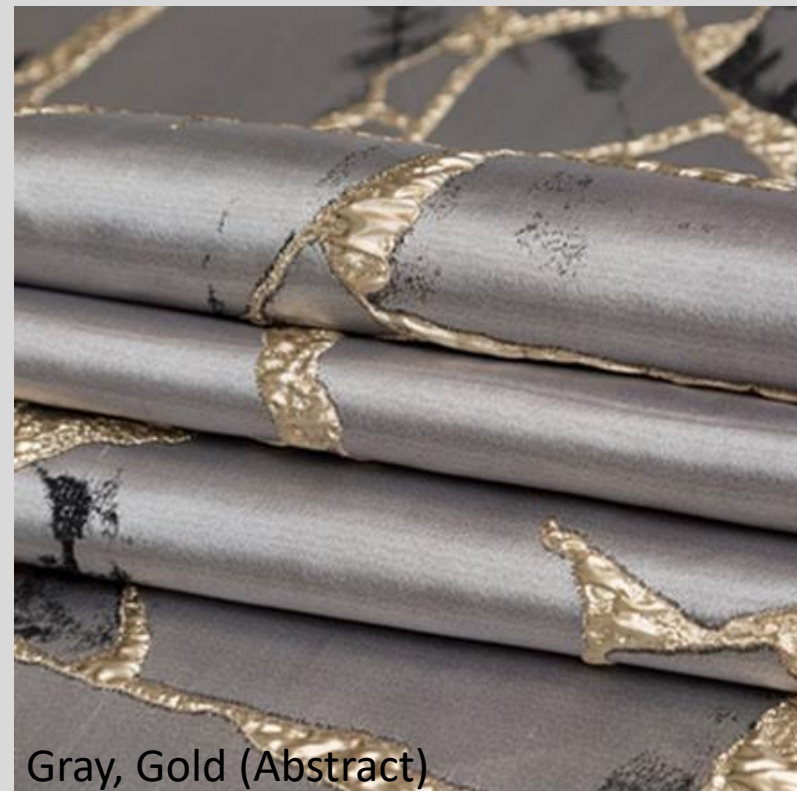
Gray, Gold (Abstract)