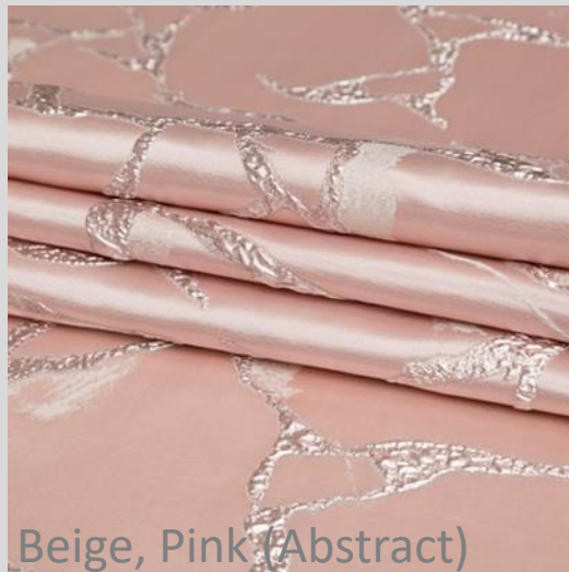
Beige, Pink (Abstract)